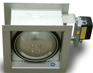
COMMERCIAL POSITIVE SEAL DAMPER