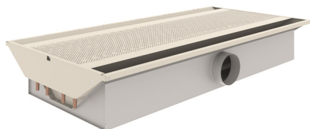
CEILING ACTIVE CHILLED BEAM