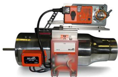
VENTURI AIR VALVE