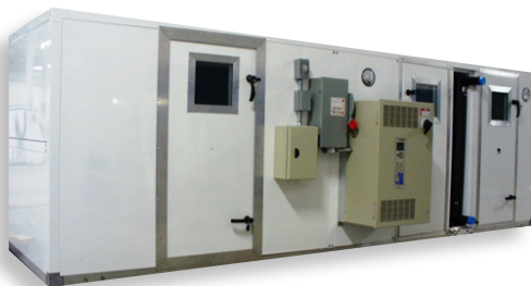
MODULAR AIR HANDLING UNIT